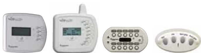
Indoor Control Panel (for 4 or 8 function control)